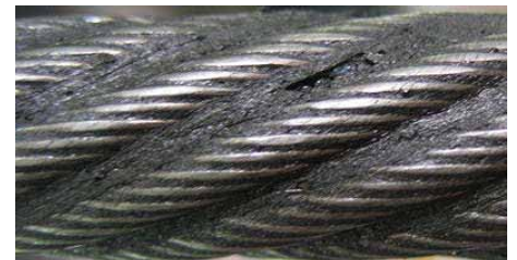
Left Lay - Counter Clockwise Rotation