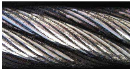
Right Lay - Clockwise Rotation