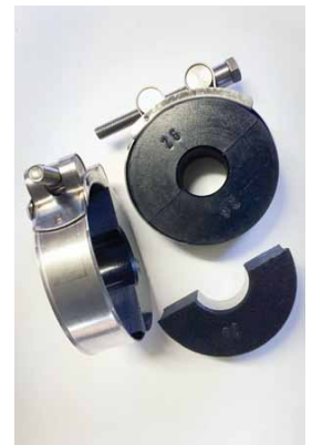
ABOVE: Smooth Bore Rope Cleaner