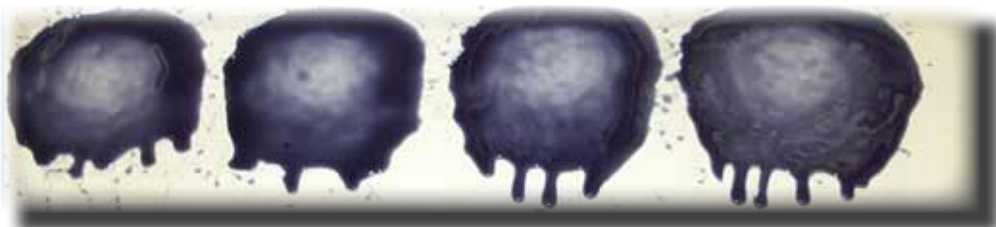
Spray pattern after converting to Pyroshield Syn Open Gear Lubricant. The spray nozzles do not clog with the Pyroshield fluid lubricant, allowing a more protective, uniform film of lubricant to be applied to the gears.