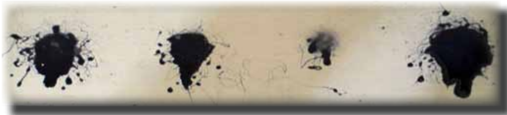
Spray pattern using commercial grade lubricant. Traditional asphaltic lubricants cause spray nozzles to clog, leading to poor application of the lubricant and the creation of damaging hot spots on gears.