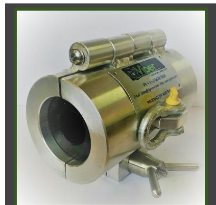
Fig 1. The Viper Manual Rope Cleaner Solution (VMRCS).