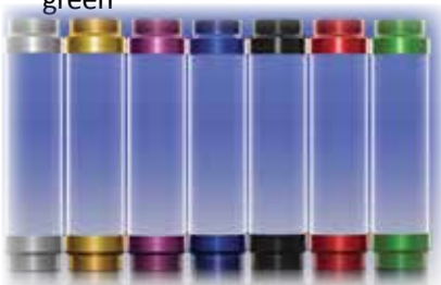
Clear Grease Tubes with Color Options