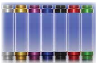
Clear Grease Tubes with Color Options