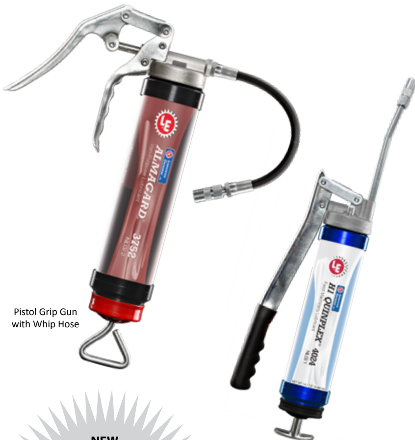
Pistol Grip Gun with Whip Hose

Reliability tool helps eliminate maintenance errors.