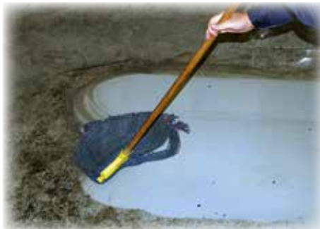
Mop, cloth or brush